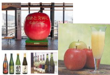
Apple, Japanese sake