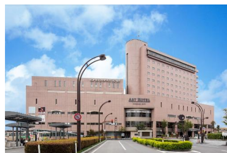
Art Hotel Hirosaki City