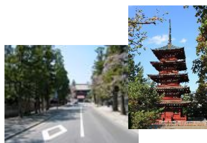
Zen temples, Five-storied pagoda